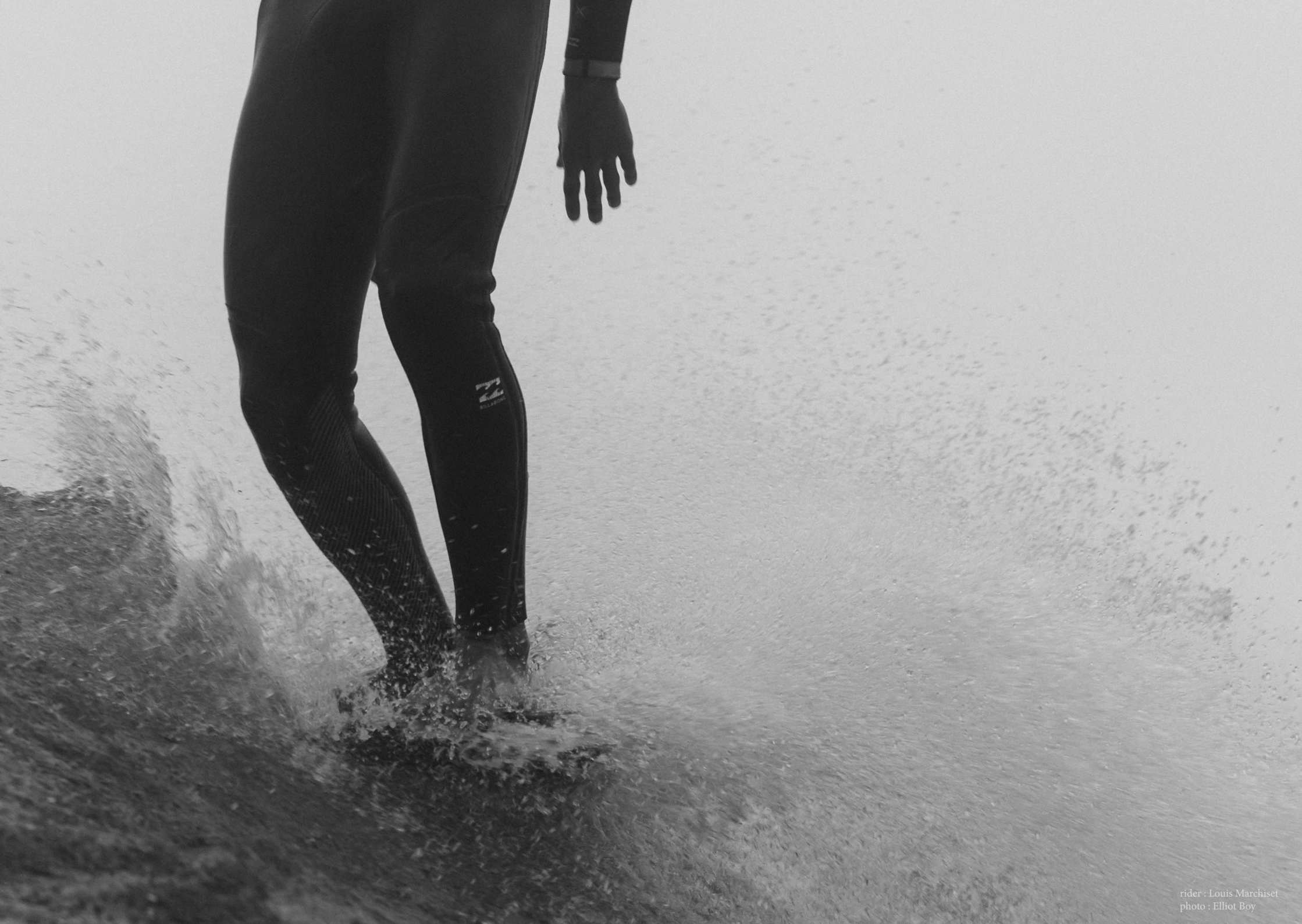
rider : Louis Marchiset