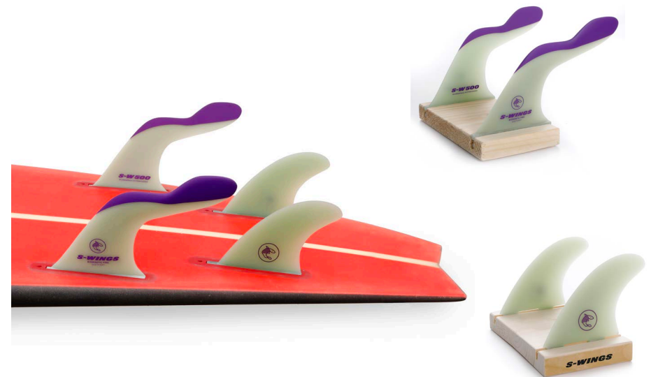
Rear Quad G10